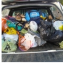
GR 2 Outing: Science Centre 20 SEP 2016